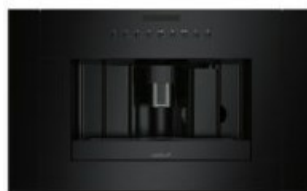
M AND E SERIES CONTEMPORARY