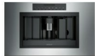
M SERIES PROFESSIONAL