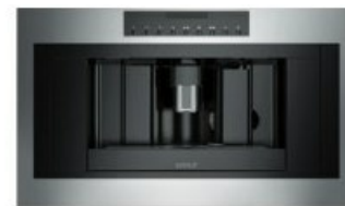
E SERIES PROFESSIONAL