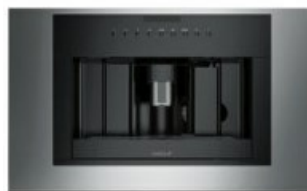
M SERIES TRANSITIONAL