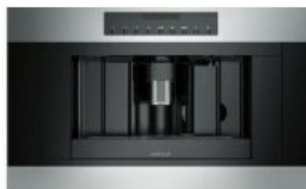
E SERIES TRANSITIONAL