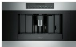
E SERIES TRANSITIONAL