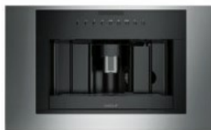
M SERIES TRANSITIONAL