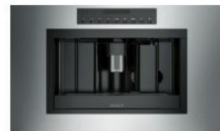
M SERIES PROFESSIONAL