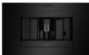
M AND E SERIES CONTEMPORARY