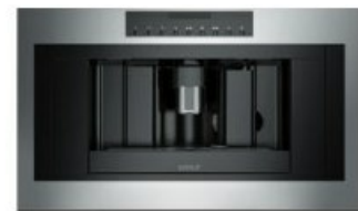
E SERIES PROFESSIONAL